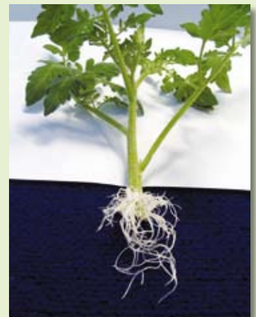
Roots of a 7 day old tomato clone grown in FytoClone.

Our customers are amazed with FytoCell's performance as are we. Used under different growing conditions, no other medium achieved these results.