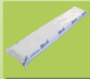
FytoSlab 900 x 180 x 80 mm