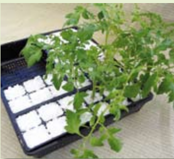
FytoClone 48 cell insert (4 x 12 cell) and perforated tray.

Get Rooted with FytoClone. Starting a plant has never been so easy. Just add water, light and warmth. FytoClone encourages large numbers of roots to grow. FytoClone is sterile and provides a well balanced environment with an excellent ratio of air to water. This results in pure white, quality roots. Hormone gel or powder is optional.