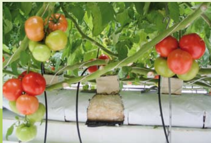
Very healthy, high yielding tomatoes growing in FytoFlake.