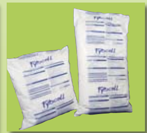
FytoFlake 50L and 100L plastic bags