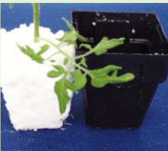
FytoClone 70mm block.