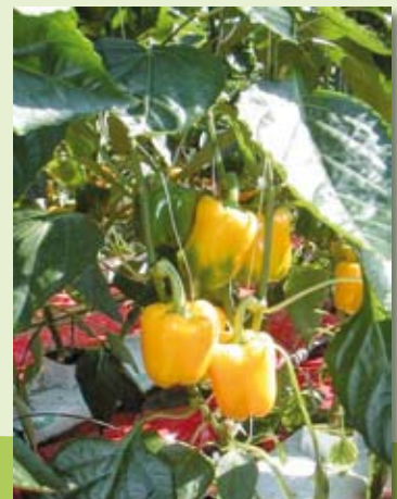
Healthy capsicums with a good fruit set growing in FytoFlake.