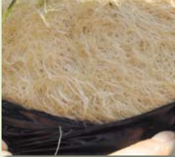
FytoCELL grown plants develop fine feeder root systems that ensure maximum nutrient uptake – unlike traditional substrates