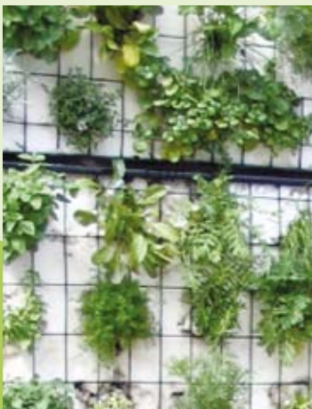
Herbs growing in a FytoSlab wall.

Grower feedback to date indicates both FytoFlake and FytoSlab provide a barrier to Scarid Fly invasion. Because FytoCELL is non fibrous Scarid Fly have difficulty penetrating the FytoCELL.