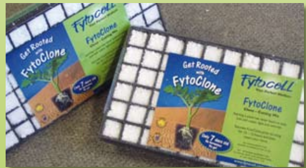
FytoClone 72 cell insert and perforated tray