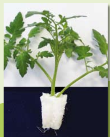
A single cell of FytoClone with a 7 day old tomato clone.