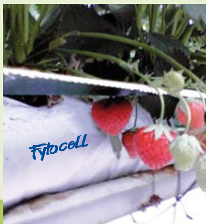
Strawberries thriving in FytoFlake bags, lying on hanging gutters.