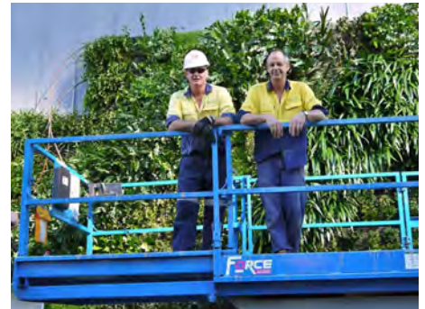
The scissor lift raises the installers and modules to position.