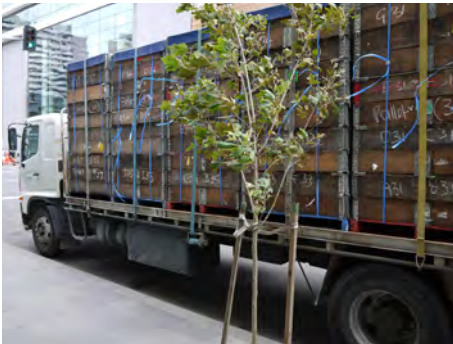
Planted panels arrive on site