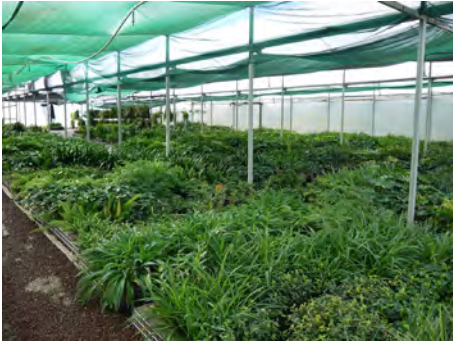
Once the planting plan is approved we plant out the modules. They are then pre grown in our green houses for 3-5 months prior to installation day.