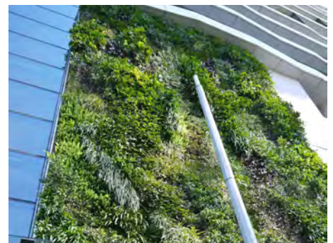
The plants quickly orientate themselves and enjoy the view.