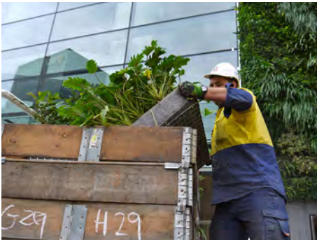
We locate the truck as close to the host wall as possible, unpack the modules directly from the back of the truck to the access equipment.