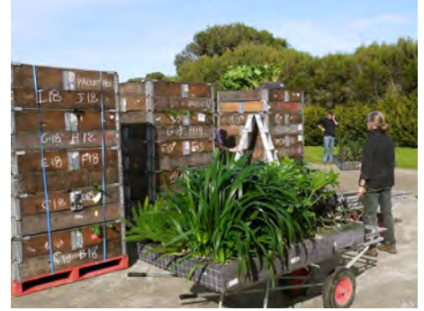
The modules are packed carefully into a palletized system.