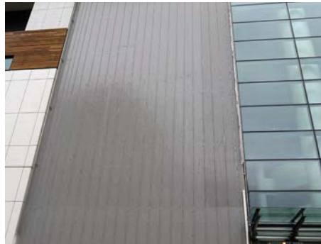
The prepared host wall. We have attached our holding hooks and applied a waterproof protective layer over the entire host wall.