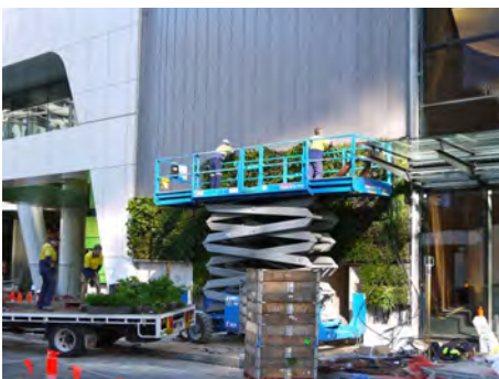
Installed like a course of bricks starting at the base and working up the building a row at a time. Each row is installed with the integral drip line for irrigation.