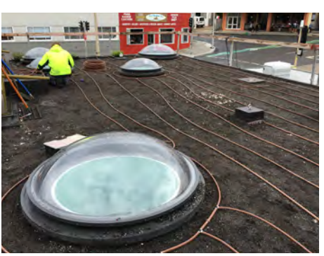
A sub-surface irrigation system is layed to suit the site requirements.

Hydrocell 40 Lightweight Planter Media is a proprietary engineered media.