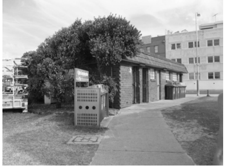
Design, and species selction specific to the surronding conditions